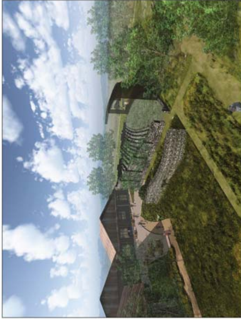
Discovery Museum and Visitor Center, Interactive Garden and Amphitheatre- facing south