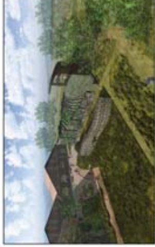
Amphitheatre and Interactive Garden