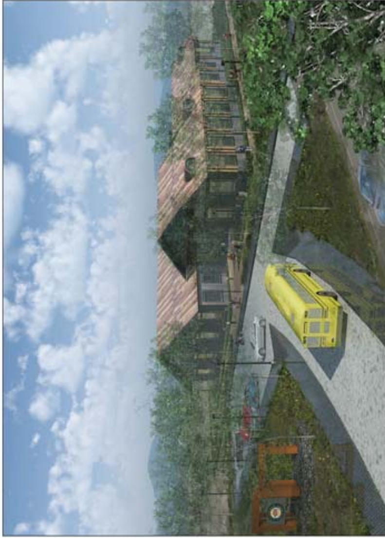
Discovery Museum and Visitor Center, Main Entry