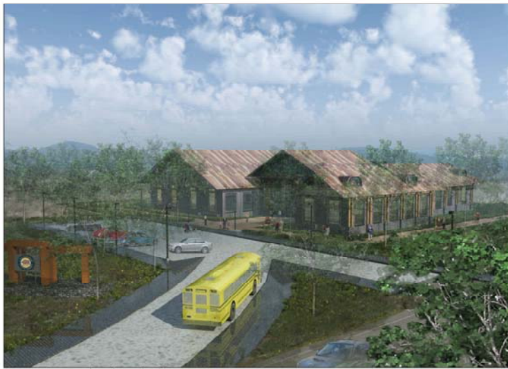
Discovery Museum and Visitor Center, Main Entry