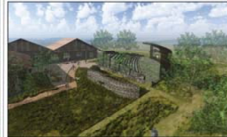
Amphitheatre and Interactive Garden

Discovery Museum and Visitor Center ANDERSON MARSH STATE HISTORIC PARK